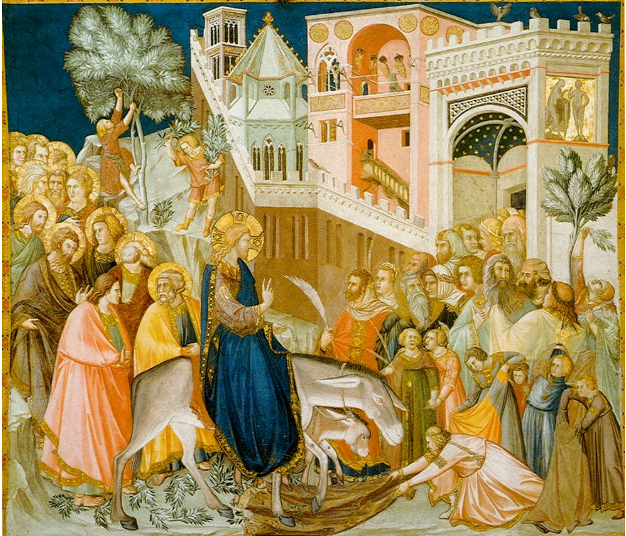
Entry of Jesus Christ into Jerusalem (1320) by Pietro Lorenzetti