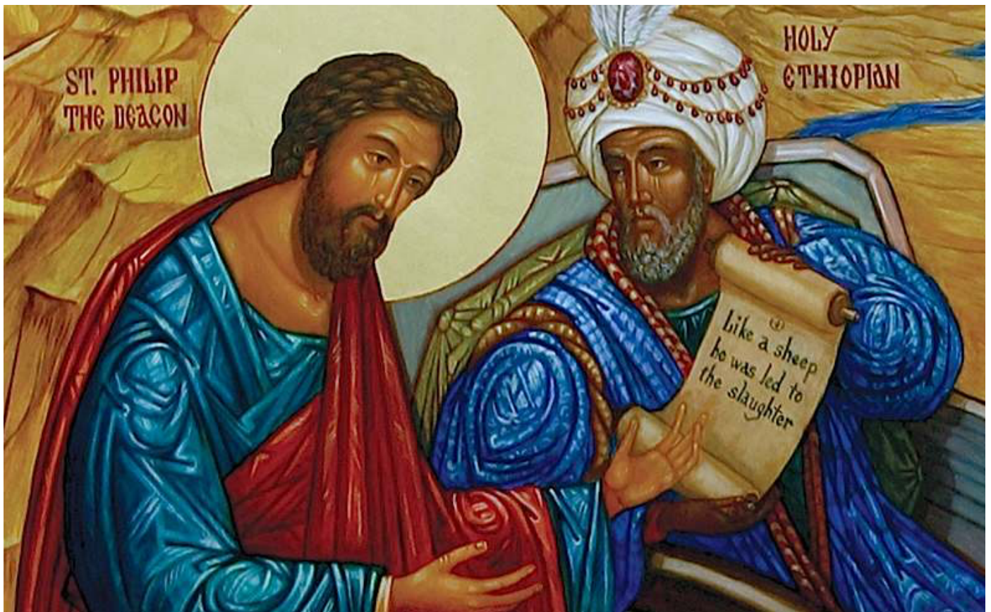
Philip and the Ethiopian Eunuch – Modern icon (detail)