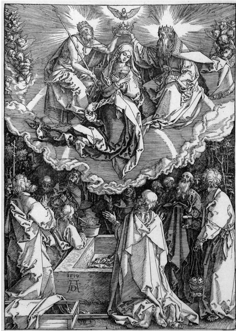
Albrecht Dürer – Mary's Assumption

Sunday in the Octave of Mary, Mother of our Lord