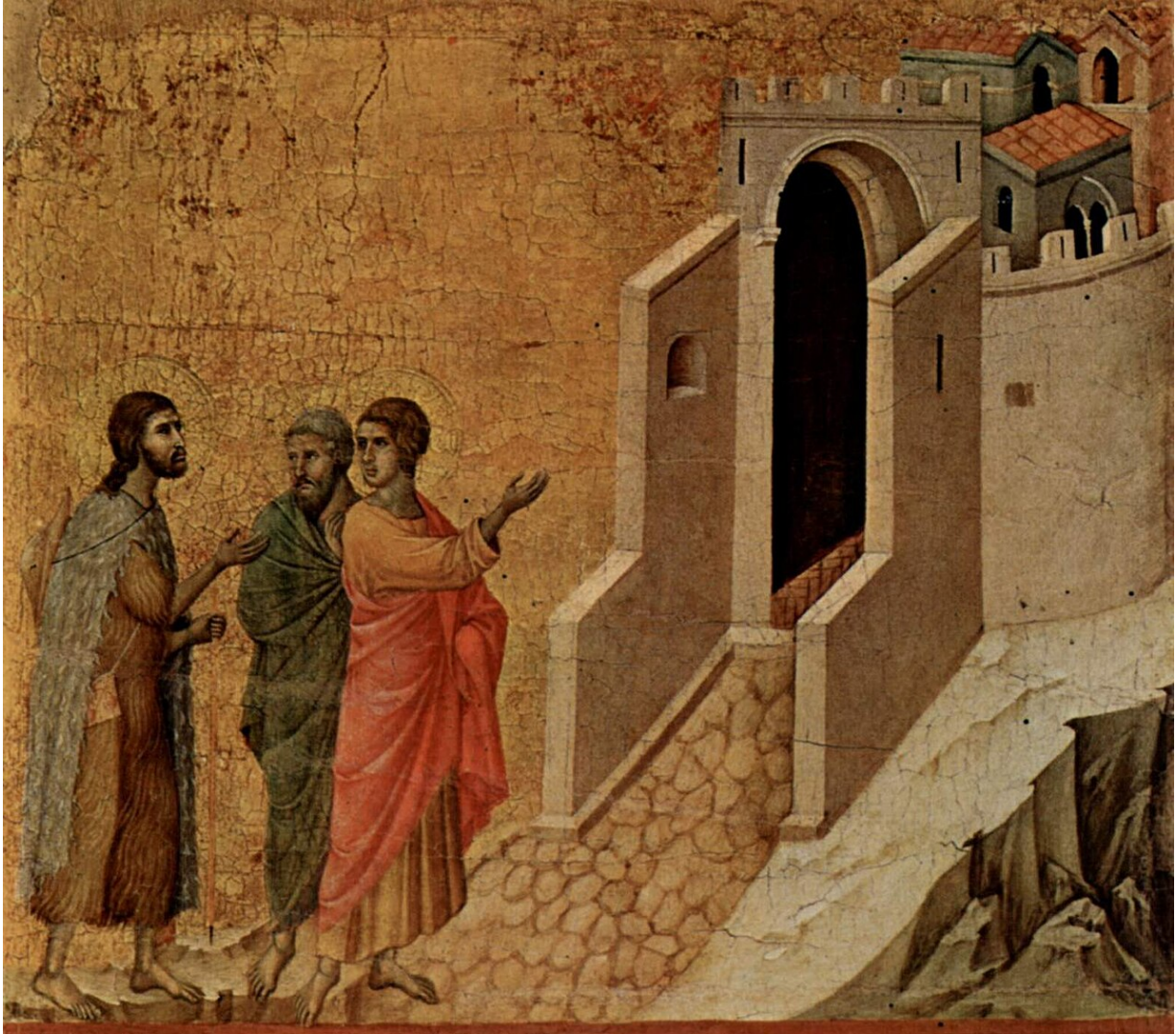
"On the road to Emmaus" – Duccio