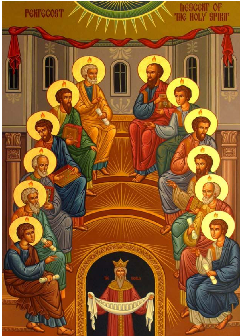
The descent of the Holy Spirit – Modern icon