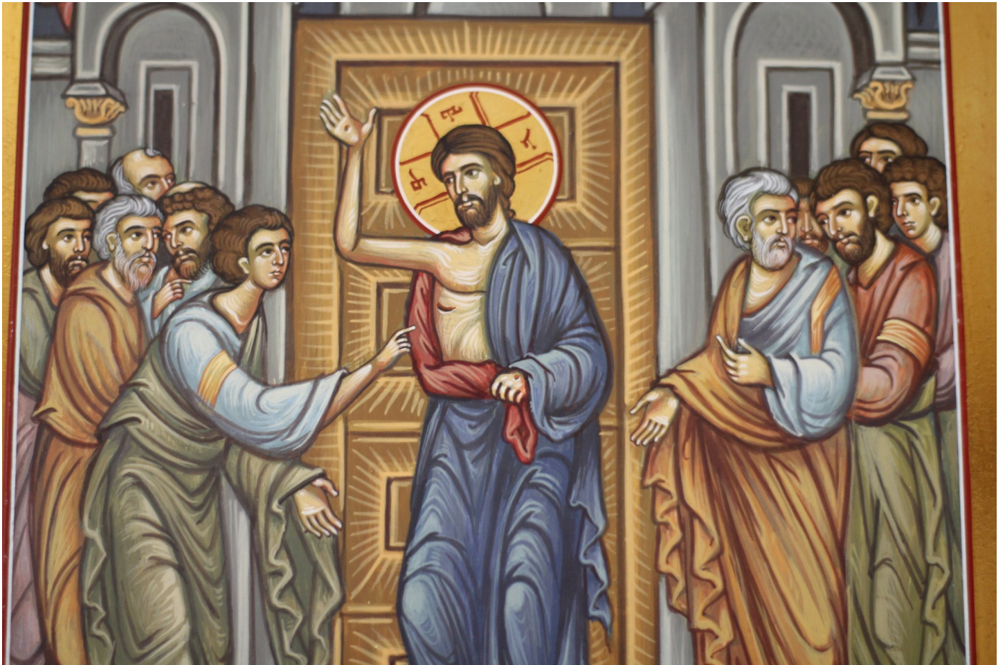
"My Lord and my God" – Modern icon