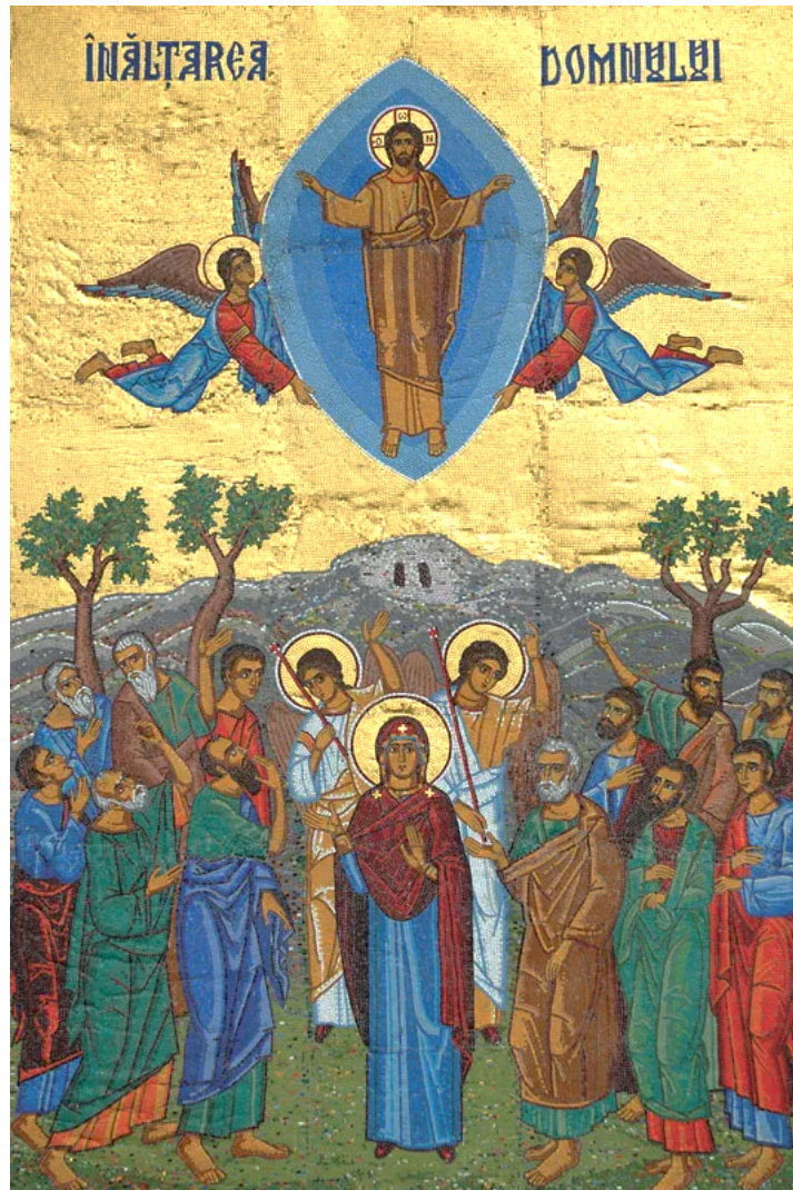
The Ascension – Modern icon