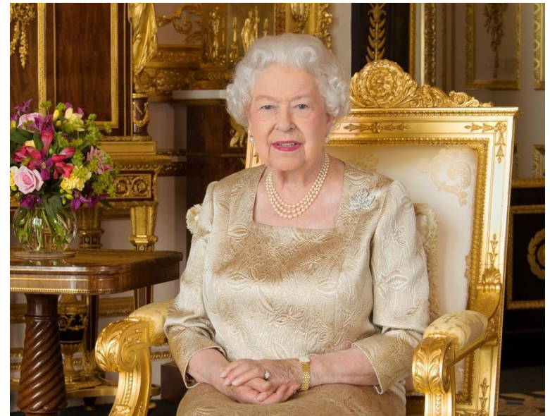
Elizabeth Alexandra Mary Windsor 21 April 1926 – 8 September 2022

HM Queen Elizabeth II Anglican Parish of Christ Church St Kilda 5pm Monday 19th September 2022.